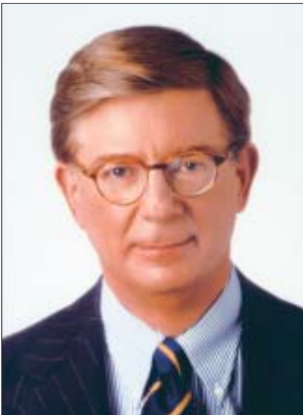
George F. Will