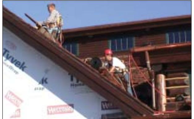
Carpenters continue roofing with cedar shake shingles. To the right of the workers is a corner of the dormer with the logs and chinking complete.

The completion date for the entire project is scheduled for September 2004.