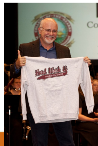
Dave Ramsey speaks at major convocation