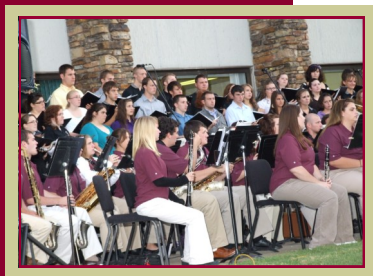
Concert Band and Chapel Choir joined forces to perform for the student body September 27, 2010.