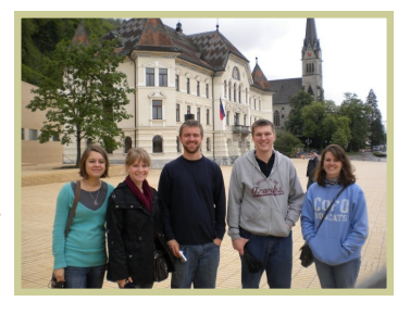
The culmination of experiences the students and chaperones were able to enjoy truly enriched the lives of all who went!

Students enjoy Salzburg, Austria, the birthplace of W.A. Mozart