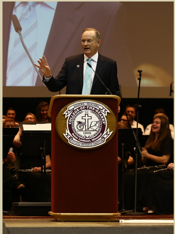
Bill O'Reilly gave a rousing speech on leadership to the students and guests.