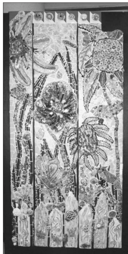
One of the eight feet tall mosaics that depicts native Missouri wildflowers.

quested for display at the Fish and Wildlife Museum at Bass Pro Shops Outdoor World in Springfield, MO and are currently on display at the Bank of Kimberling City in Kimberling City, MO. Because of the mosaics nature theme, they may possibly be used as the backdrop for the dedication of the new Fish and Wildlife Museum this fall by former Presidents George Bush and Jimmy Carter. After their tour, the mosaics will be permanently displayed on a wall at Blue Eye Elementary and Middle School.