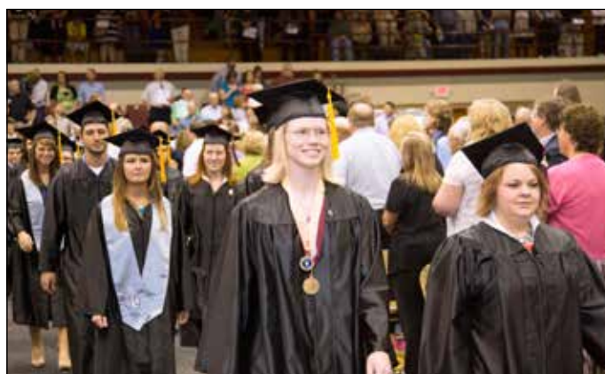
The Class of 2013 included 270 graduates who participated in the Commencement ceremony on Sunday, May 12.