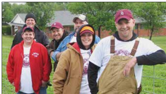
Inclement weather didn't stop some members of Team 9 from building a fence at the construction site of Rose Mann Hall.