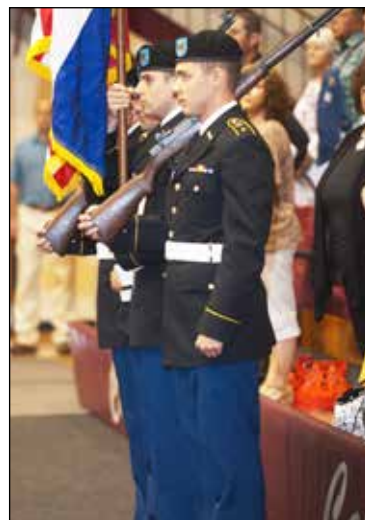
The ROTC Color Guard posts colors at the beginning of the ceremony.