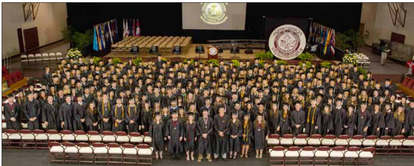
Class of 2013