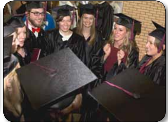
The 2012 Nursing Class gathers after Commencement to congratulate each other and celebrate.