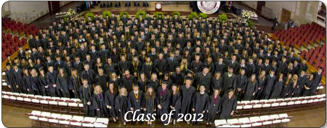
Class of 2012