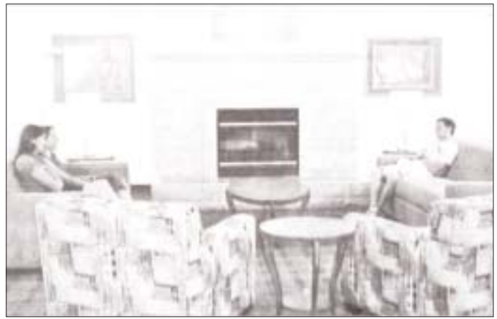
Students enjoy relaxing in the student lounge. Alumni will remember the fireplace as the original one on the east wall of the old Thompson Dining Hall.