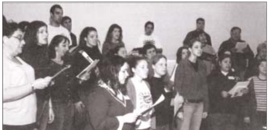
C of O Chorale and music alumni participate in the new music center's open house.

was goals for the chapter. Ideas were as follows: 1) web page designed by Shann Swift, Matt Holloway, computer majors or a combination of the three; 2) a newsletter that would increase