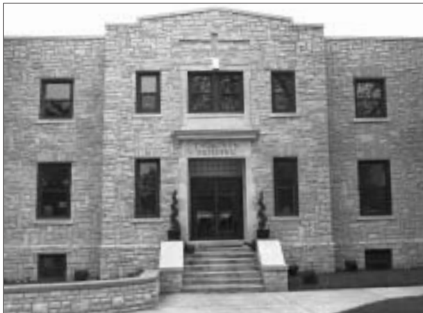
The oldest building on campus, the Thompson Building, has received a complete renovation while preserving the original exterior. It now houses the Campus Ministries Department.