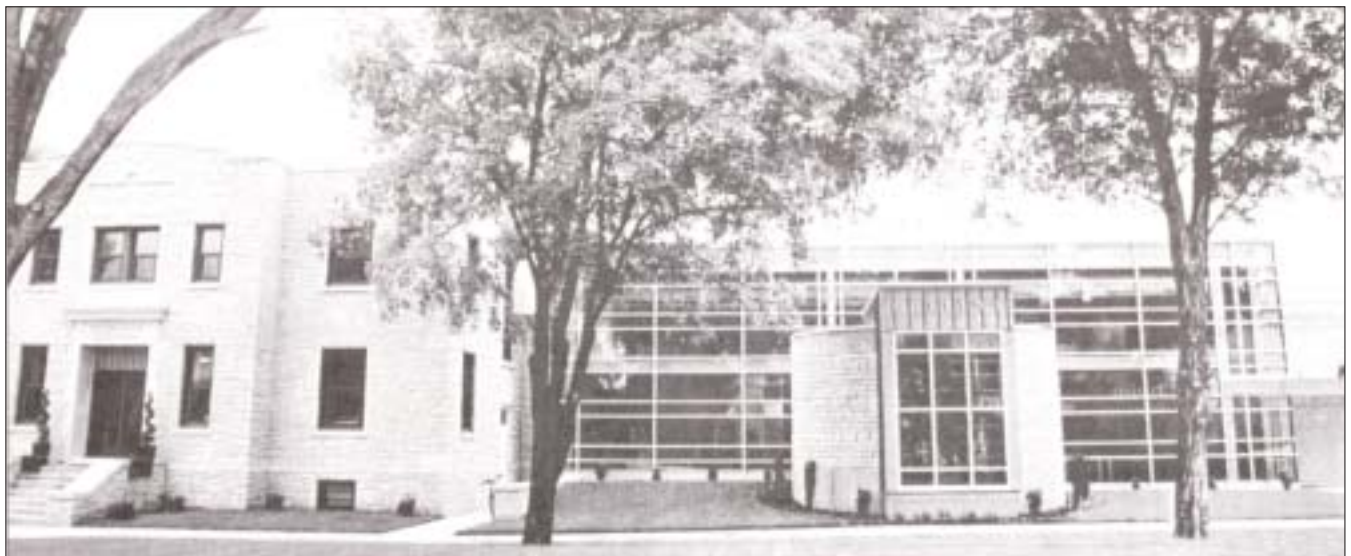
The old Thompson Annex has been dramatically transformed with a beautiful glass facade and the addition of a prayer chapel.