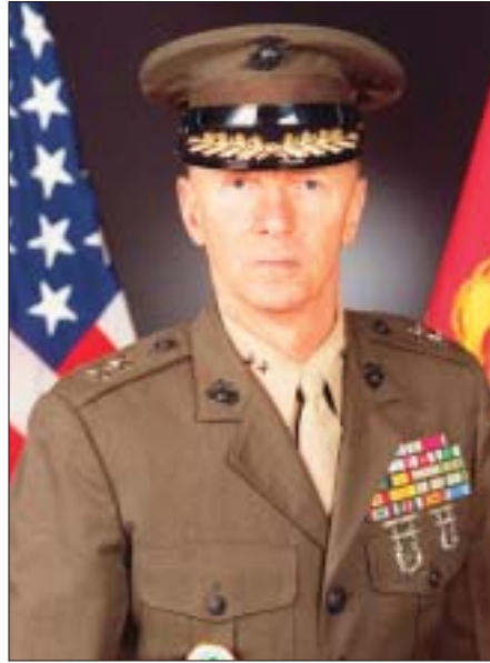
USMC Lieutenant General Gary H. Hughey '65

USTRANSCOM was established in 1987, as the sin-