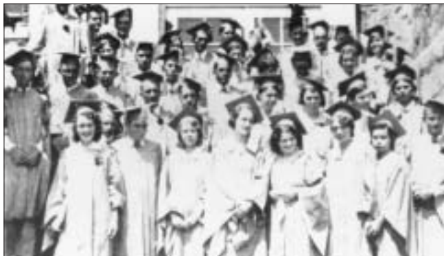
Class of 1932—70th year reunion